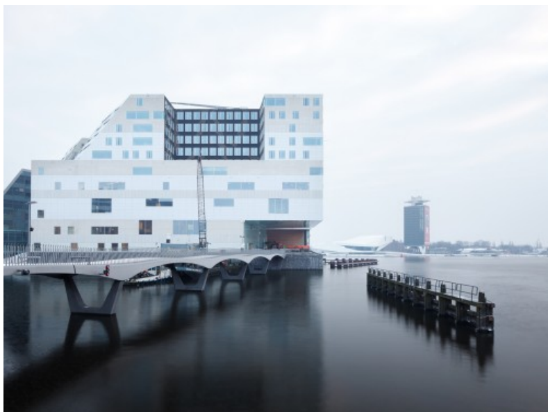
Â© Stijn Bollaert