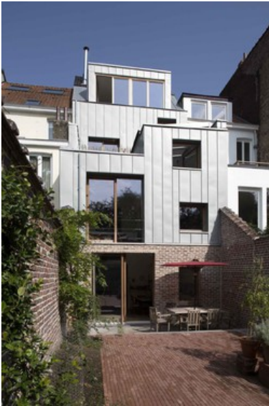
Â© Olivier Cornil