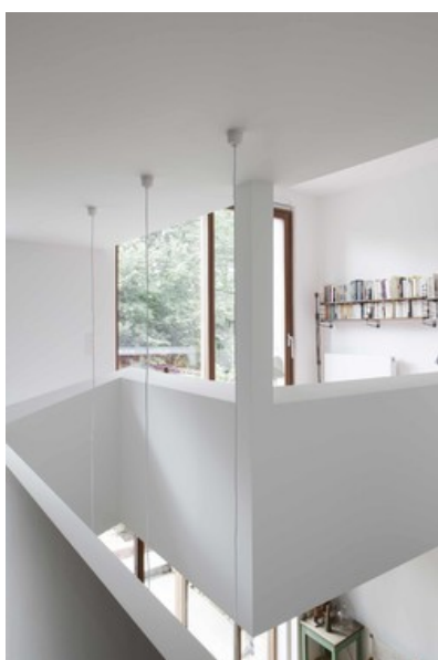
Â© Olivier Cornil