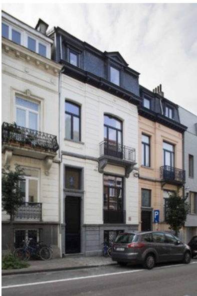
Â© Olivier Cornil

ATELIER THEATRE JEAN VILAR - 2015-2017 2020 - Louvain-la-Neuve