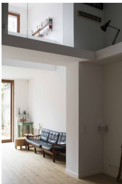
Â© Olivier Cornil