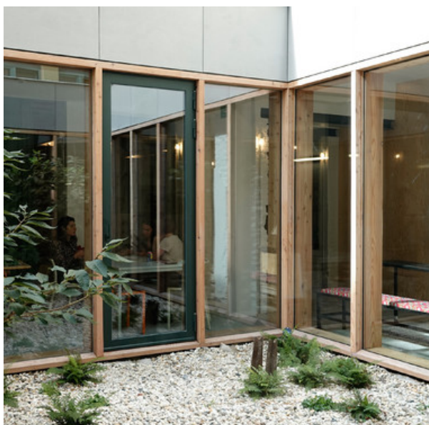
Â© Alice Piemme / AML