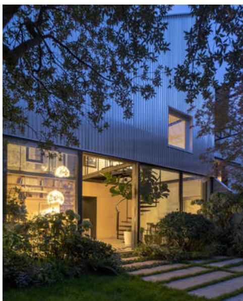
garden facade