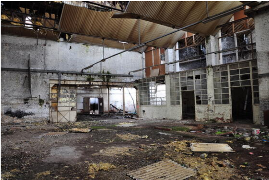
existing site