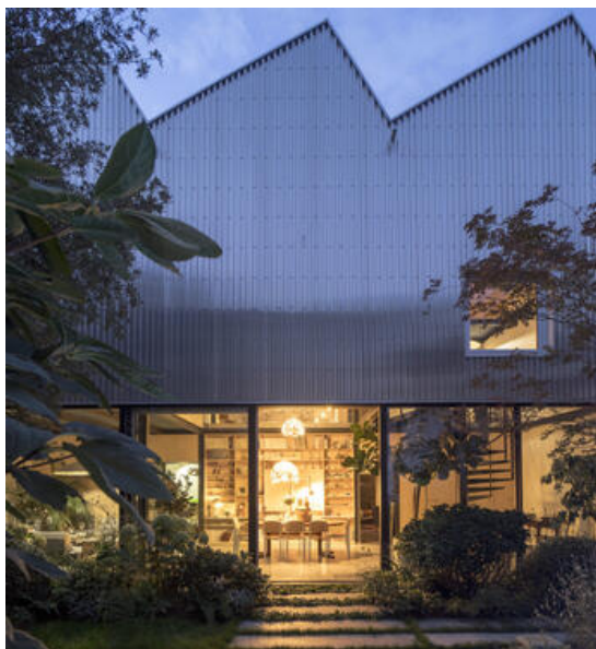
garden facade