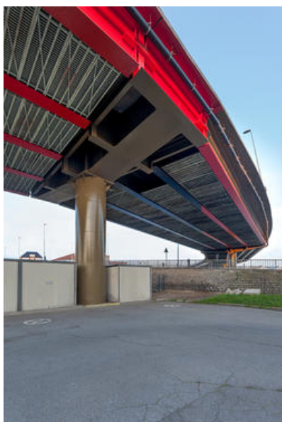
Â© Marie-Noelle Dailly