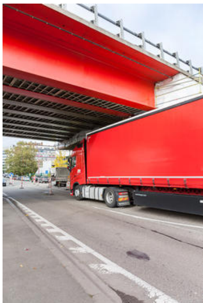
Â© Marie-Noelle Dailly