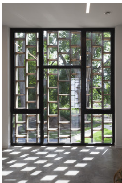
Â© Marie-NoÃ«lle Dailly