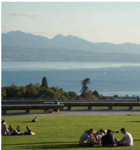
Â© Radiance 35