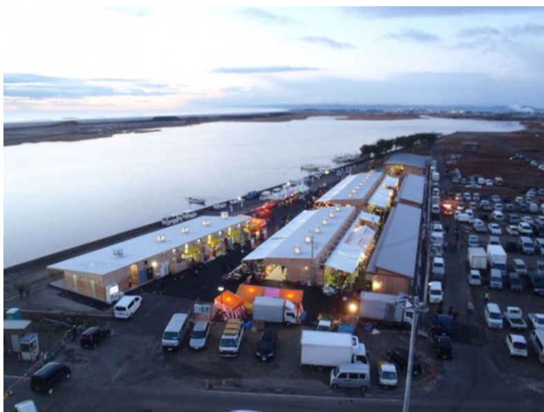
New Yuriage Morning Market JIA/SHAA/SHSH