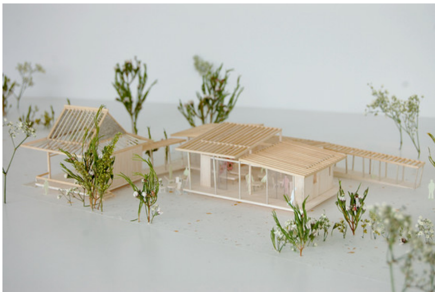
Yuriage Machi Cafe Model for the "Invisible Needs of Life" Exhibition at VAI (Flemish Architecture Institute), SHSH