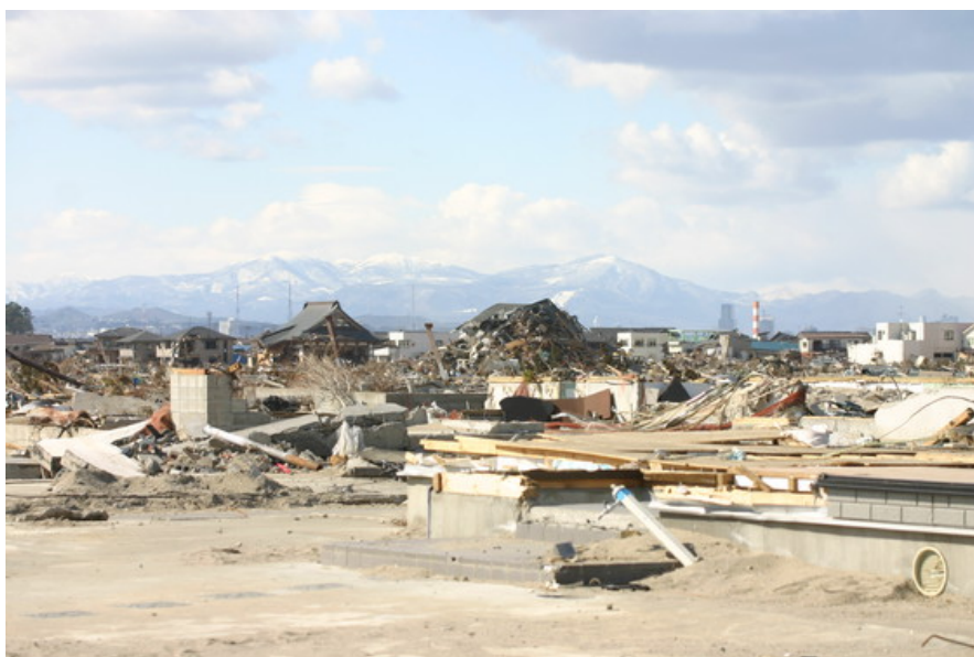
Aftermath of Tsunami