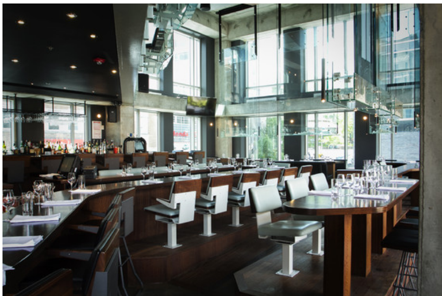
Â© SPKTR Architects