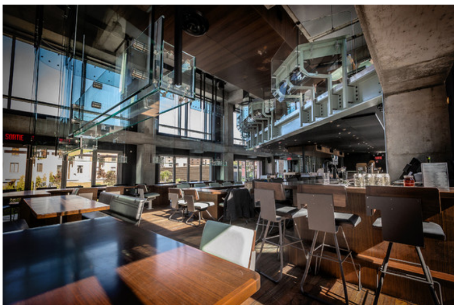
Â© SPKTR Architects