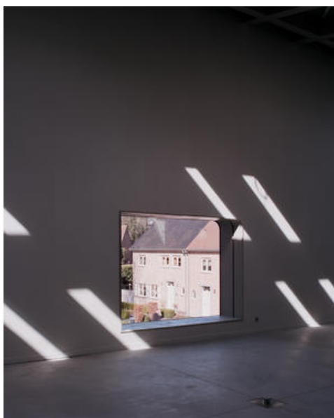
Firestation_multipurpose space