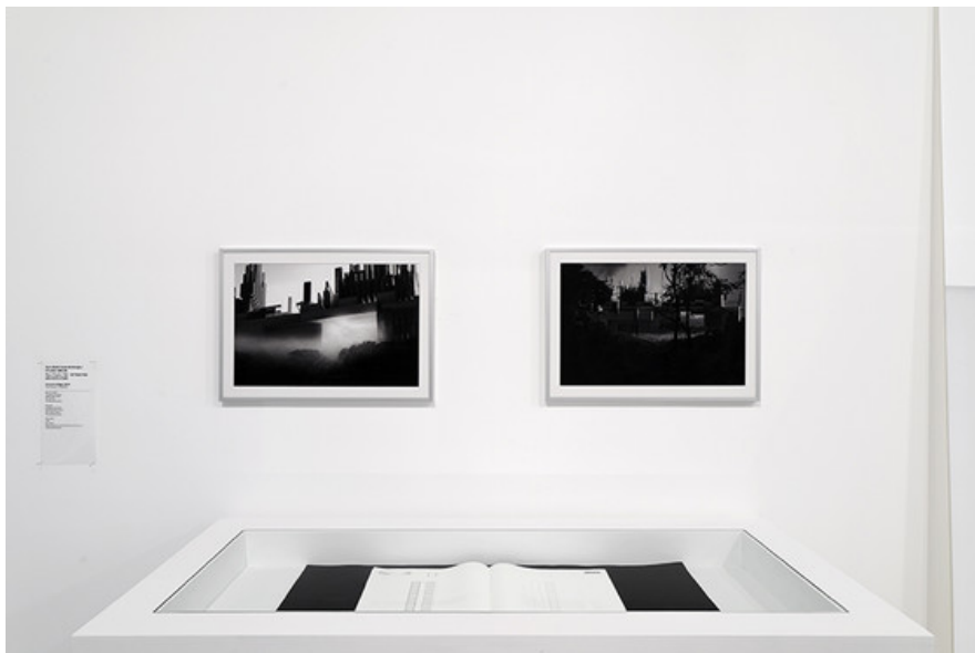
GESAMTCOLLAGES, exhibition, FRAC CENTRE, Orléans (FR)