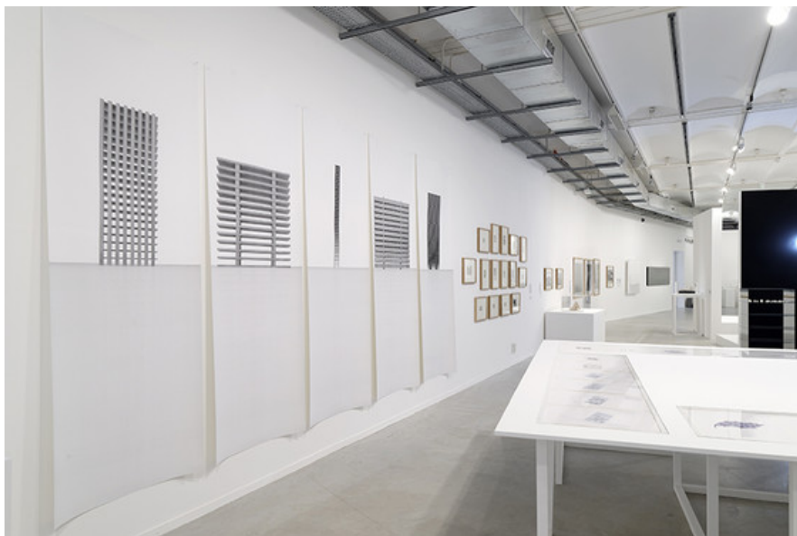
GESAMTCOLLAGE, exhibition, FRAC CENTRE, Orl ans (FR)   