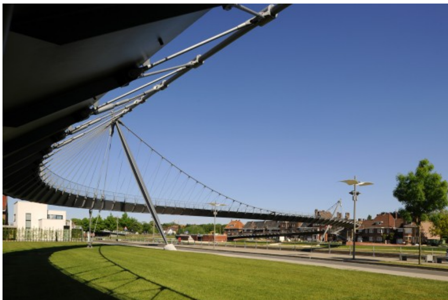
College bridge