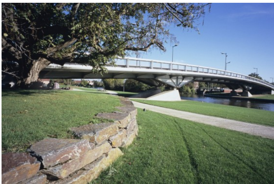
Groeninghe bridge