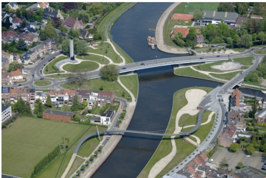
Aerial view of the parc, College and Groeninghe bridges