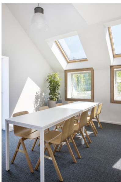
Â© Synergy International