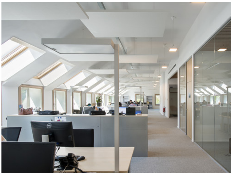
Â© Synergy International