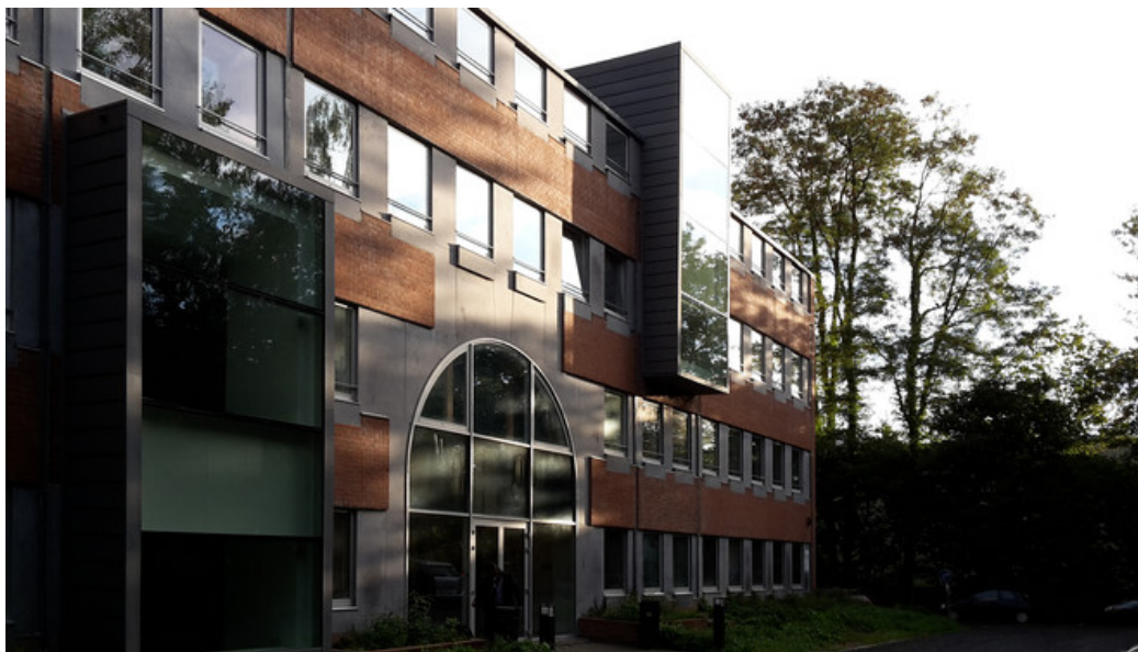
Â© Synergy International