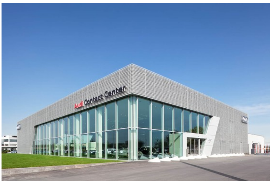
Â© Urban Platform