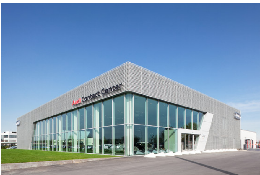
Â© Urban Platform