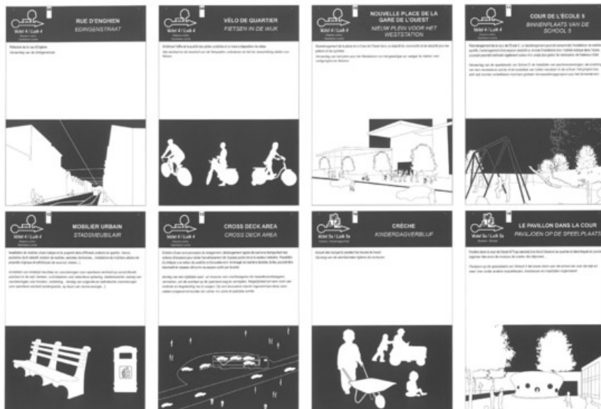
ÂC Urban Platform