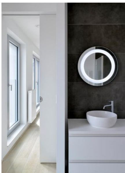
Â© Urban Platform