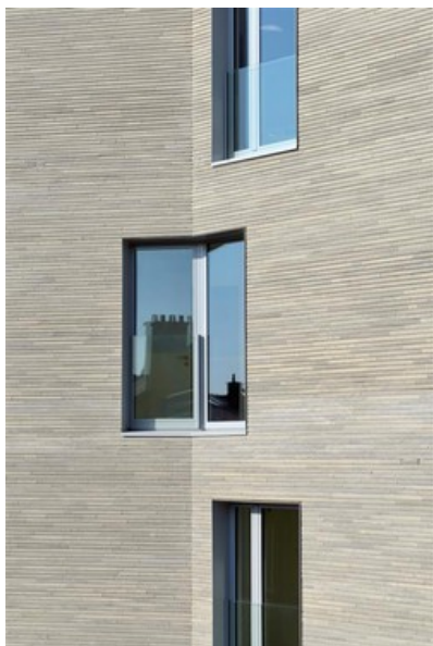
Â© Urban Platform