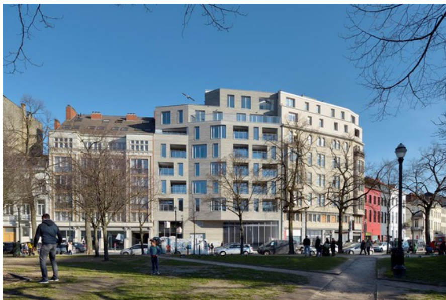
Â© Urban Platform