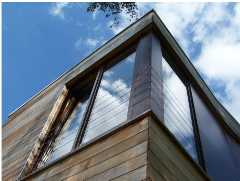
Â© V2W Architectes sprl Â© Â© V2W Architectes sprl