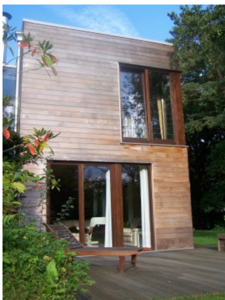
Â© V2W Architectes sprl Â© Â© V2W Architectes sprl