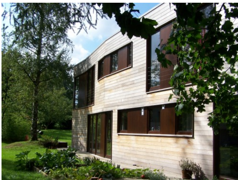
Â© V2W Architectes sprl Â© Â© V2W Architectes sprl