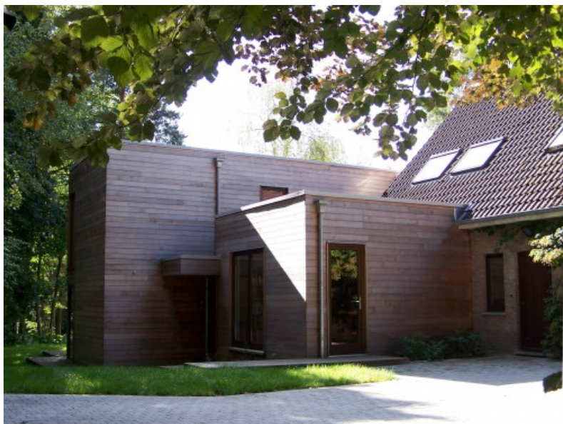
Â© V2W Architectes sprl Â© Â© V2W Architectes sprl