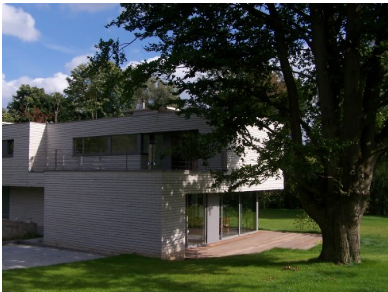
© V2W Architectes sprl © © V2W Architectes sprl