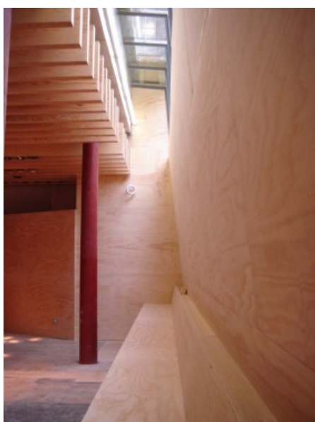
Â© Vanden Eeckhoudt-Creyf architectes