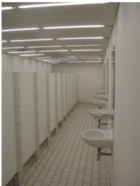
Â© Vanden Eeckhoudt-Creyf architectes