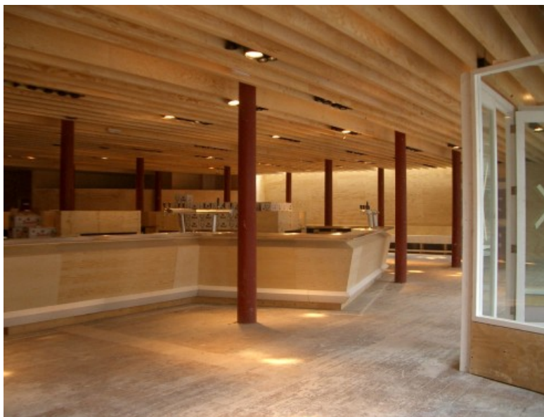
Â© Vanden Eeckhoudt-Creyf architectes