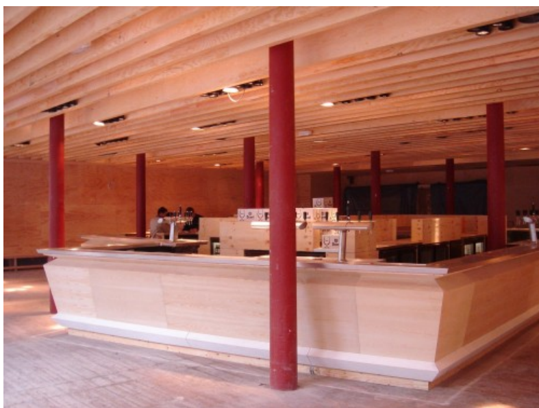
Â© Vanden Eeckhoudt-Creyf architectes