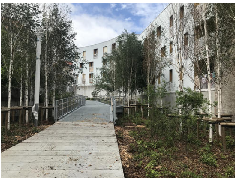
Â© Vanden Eeckhoudt-Creyf architectes