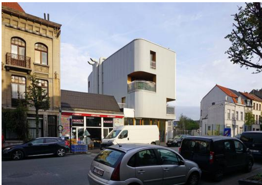
Â© Vanden Eeckhoudt-Creyf architectes