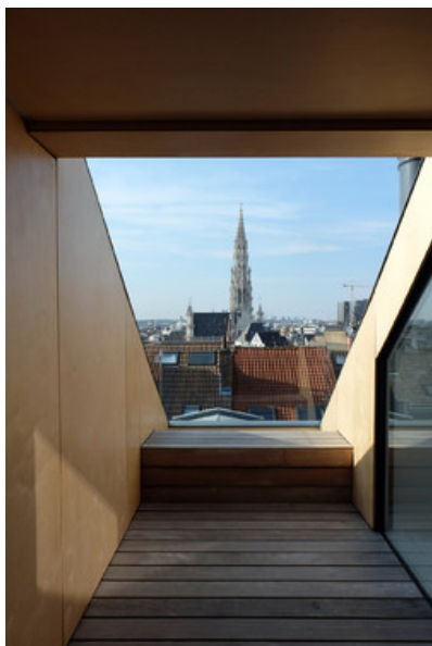
View from the new terrace