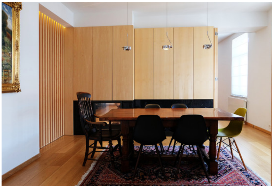
Furniture wall from the dining-room side