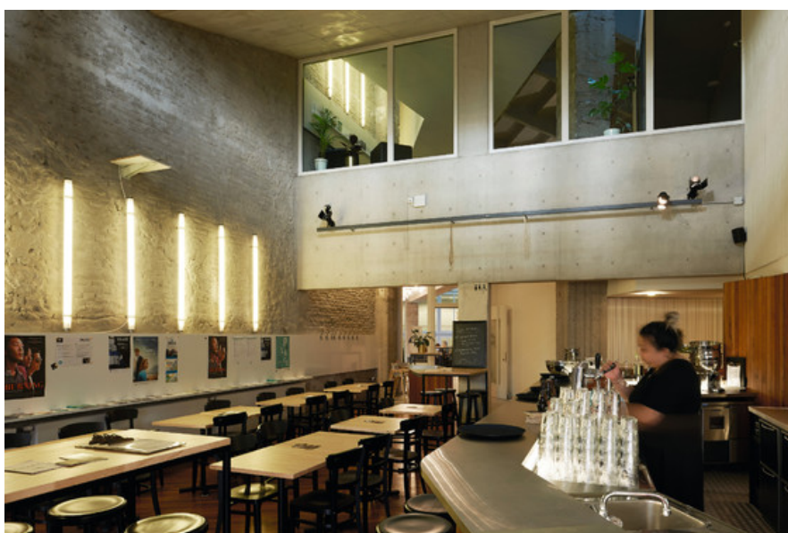
The bar-restaurant in relation with the foyer