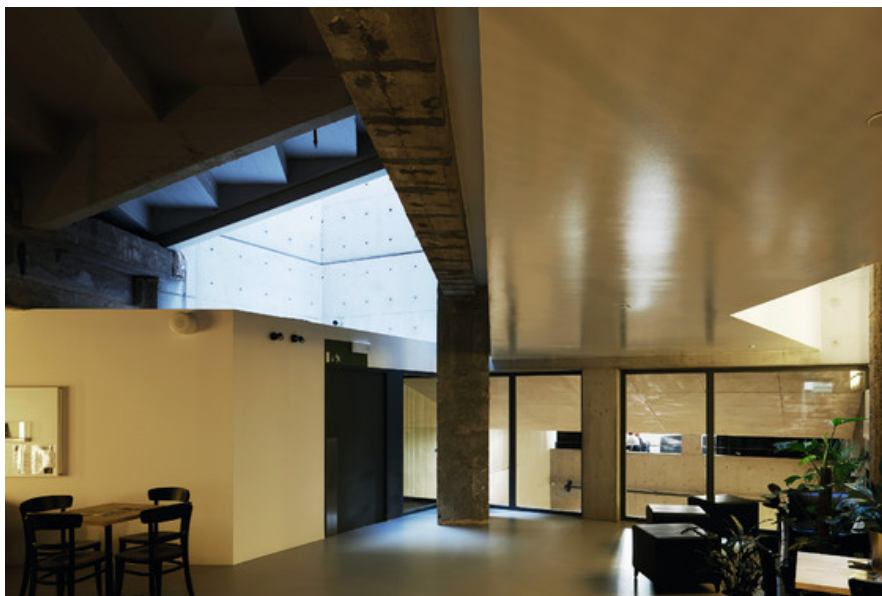
The foyer, a multifunctional place enabling multicultural exchanges