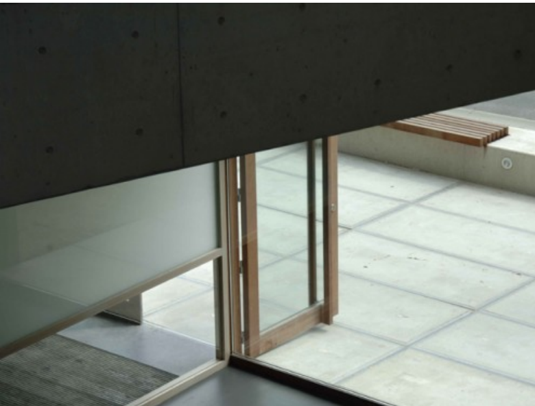
Â© Alain Janssens