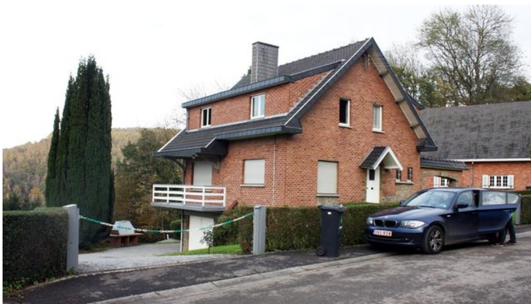
Â© acmia - atelier d'architecture