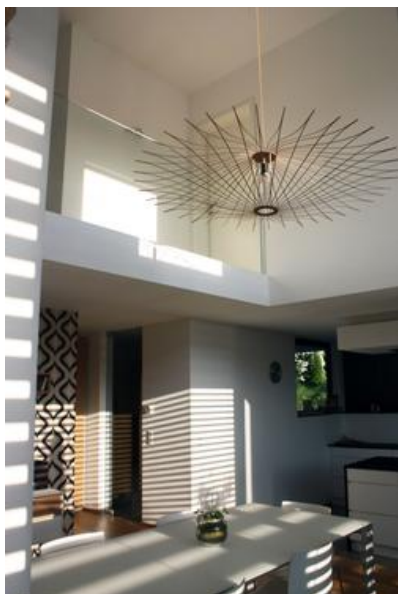
Â© acmia - atelier d'architecture