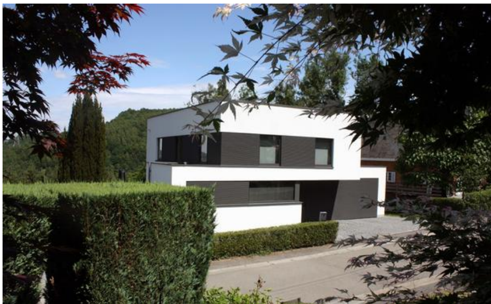
Â© acmia - atelier d'architecture