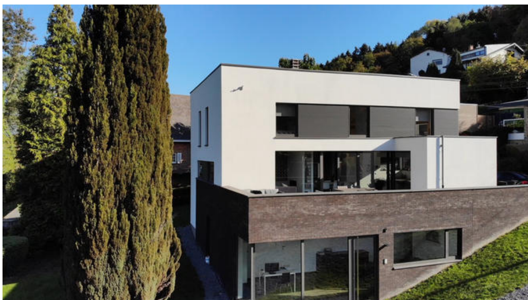
Â© acmia - atelier d'architecture