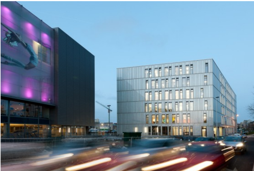
Â© Marc Detiffe