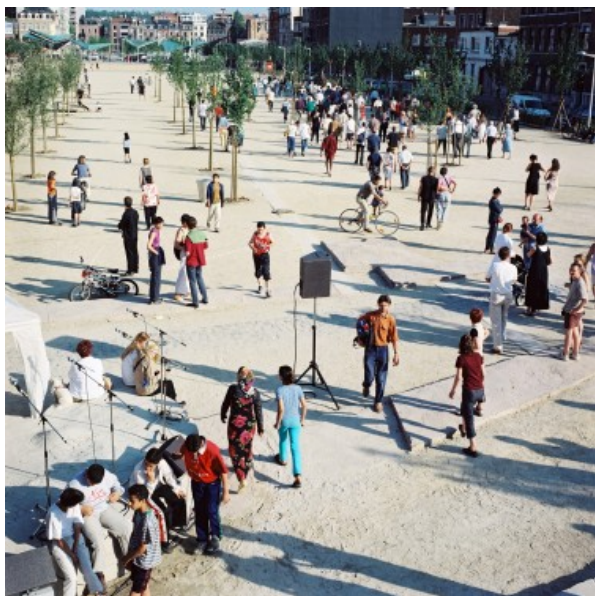
Â© Alain Janssen