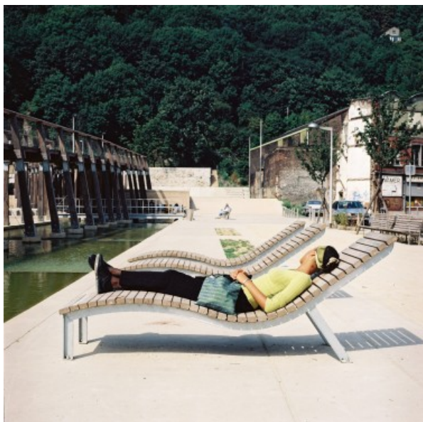
Â© Alain Janssen