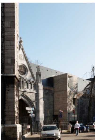
stairwell/buttness. © Alain Janssens