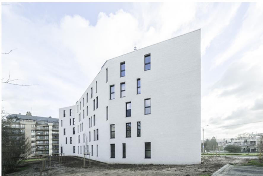
Photography : Pedro Correa Â© atelier d'architecture mathen