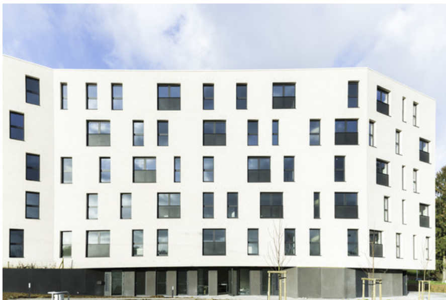
Photography : Pedro Correa Â© atelier d'architecture mathen