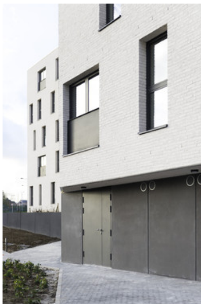
Photography : Pedro Correa Â© atelier d'architecture mathen