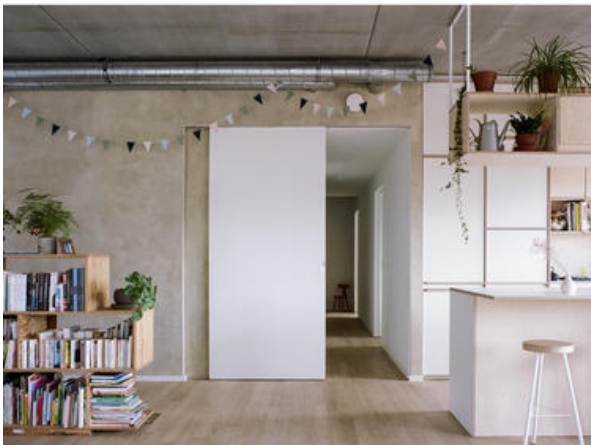
Cohousing Tivoli - lot 07 Â© Severin Malaud