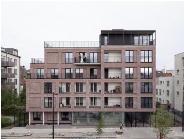
Cohousing Tivoli - front facade