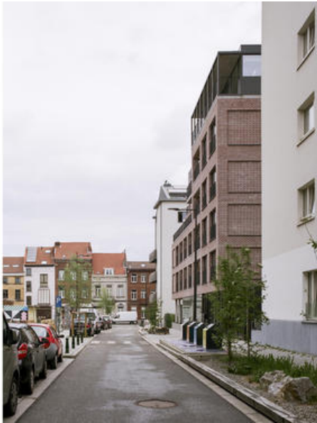
Cohousing Tivoli - front facade