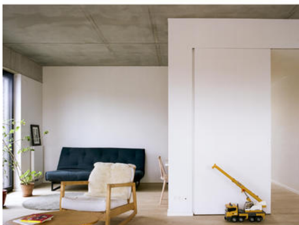
Cohousing Tivoli - lot 09