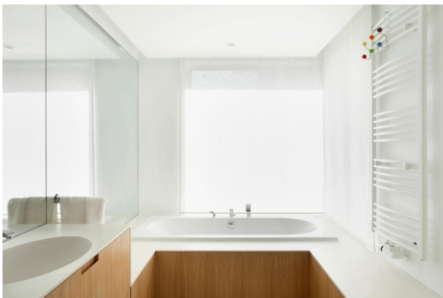
Â© Maxime Delvaux