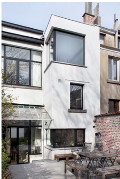
Â© Maxime Delvaux