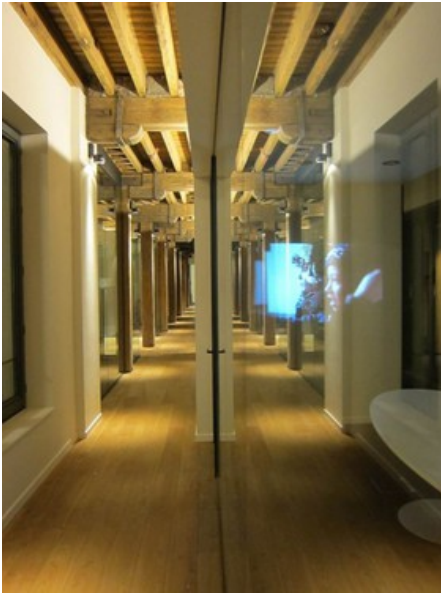
Â© oPla architecture sc prl