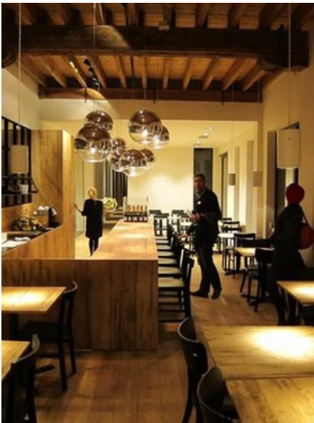
Â© oPla architecture sc prl