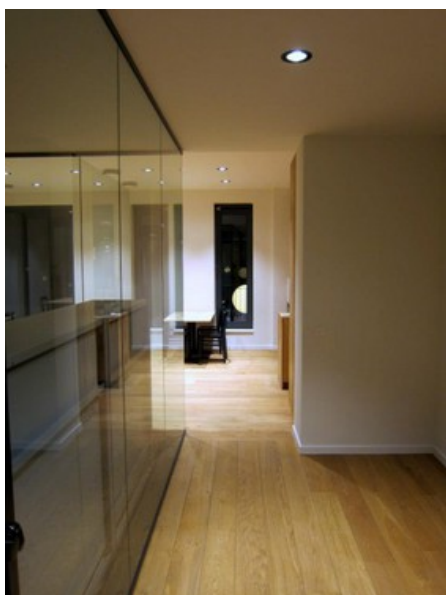
Â© oPla architecture sc prl