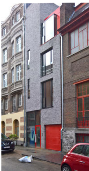
Front facade Â© van der Plancke architecte s.r.l.