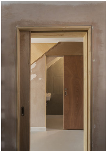
Â© Morales Finch