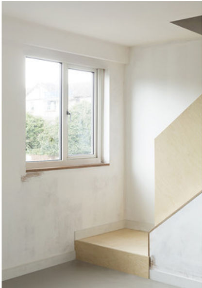
Â© Morales Finch