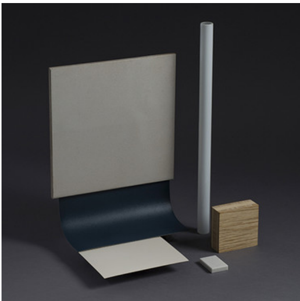
Â© Morales Finch