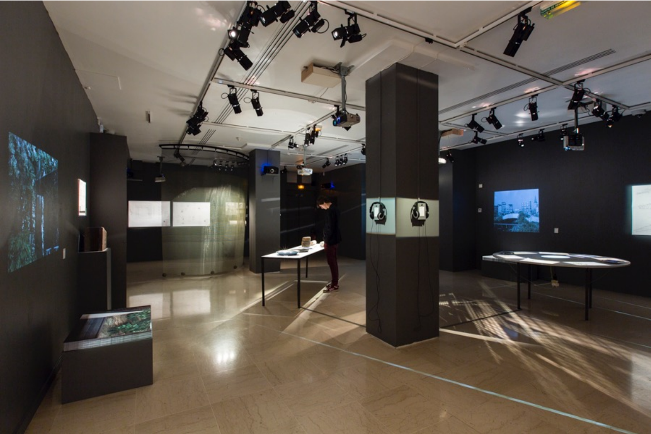
entrer: in Paris, 2015/11/05 - 2016/01/12