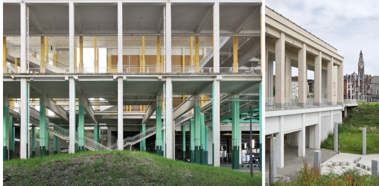
Charleroi Palais des Expositions

AgwA, architecten jan de vylder inge vinck Charleroi, Hainaut (BE)